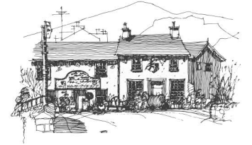
THE COPPERMINES LAKES COTTAGES

Take in the spectacular scenery of Coppermines Valley and visit the Coppermines Heritage Waterwheel . This walking trail takes you up into the spectacular Coppermines Valley and takes in the Copper Heart Stone and working Waterwheel .