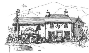
THE COPPERMINES LAKES COTTAGES

A must for all those visiting the South Lakes, this route starts at the Hidden Treasures Gift Shop and reaches the summit of Coniston Old Man via Low Water . The return journey takes in the spectacular Goat's Water before rejoining the Walna Scar Road and descending back to Coniston Village.