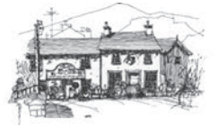
THE COPPERMINES LAKES COTTAGES

Starting in the picturesque village of Coniston, ramble through the peaceful Tarn Hows Wood , to one of the most beautiful tarns in the Lake District National Park, Tarn Hows . This moderate hike has an optional detour to the majestic Tom Ghyll waterfall . Pack some sandwiches and make a stop at the picnic area above the Tarn, the views of the Cumbrian fells are spectacular!