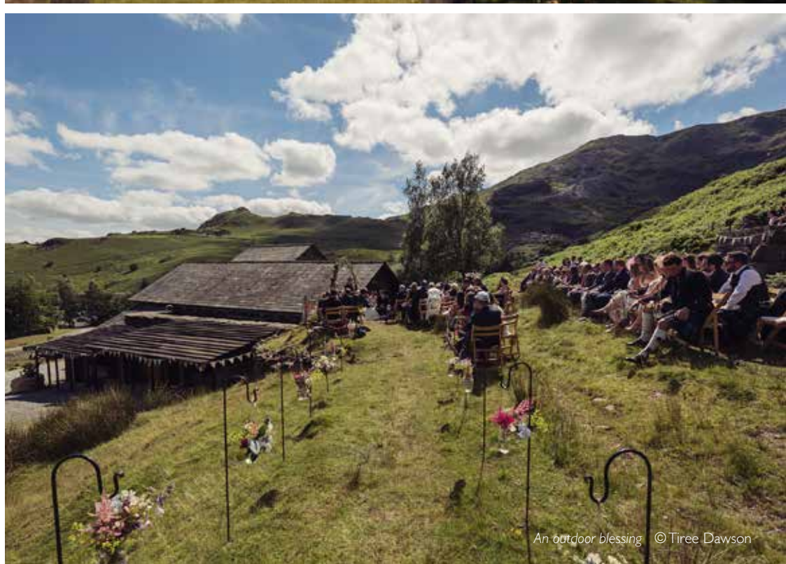
An outdoor blessing